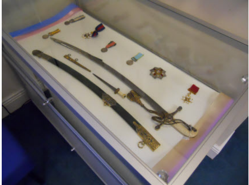
The new display of Sir Charles Knight Pearson's medals and ceremonial sword. The display also features his father's Naval dirk and scabbard.