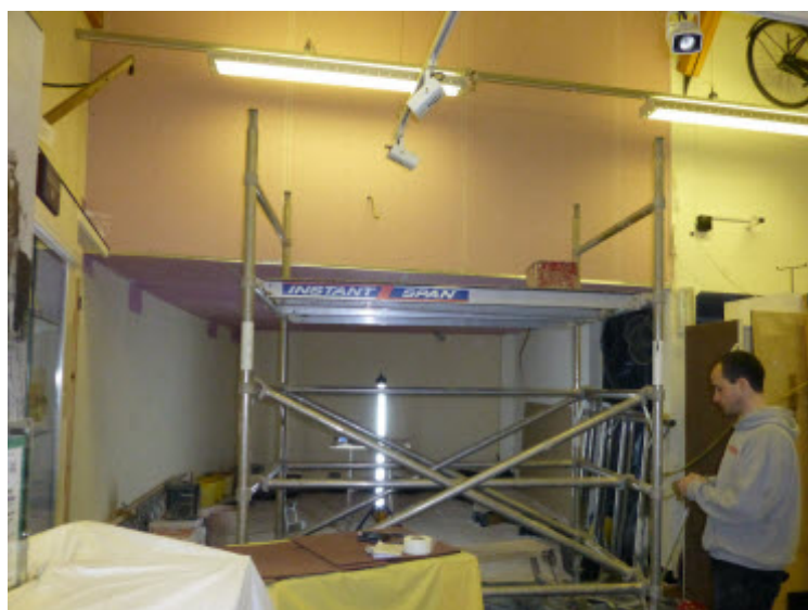
Work in progress in the museum

Work by the contractors started on 7 January. It has been all 'hands to the pump' to move exhibits and displays to create space for the workmen. The Museum is now closed to the public and re-opening is expected at Easter.