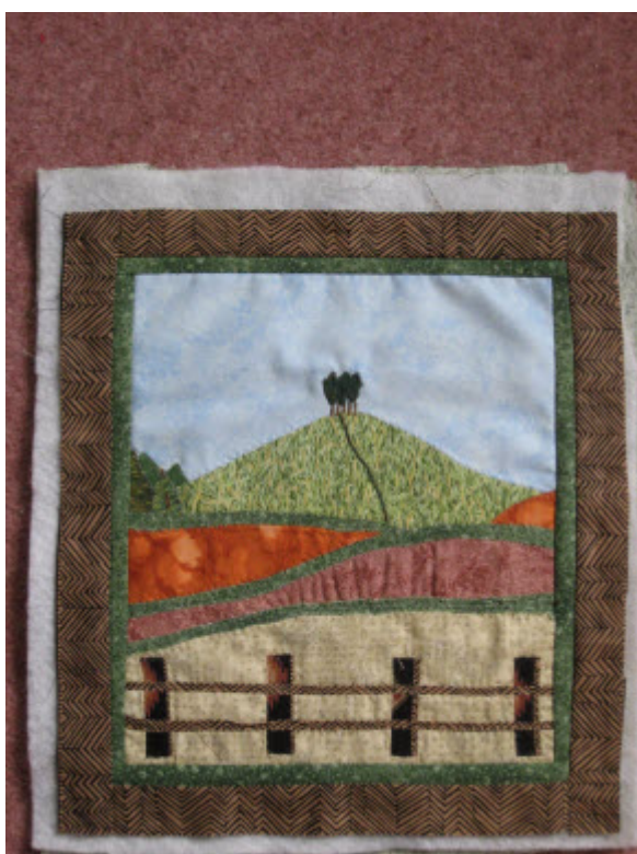
The Colmer's Hill Quilt

Follow us on Facebook and Twitter @bridportmuseum